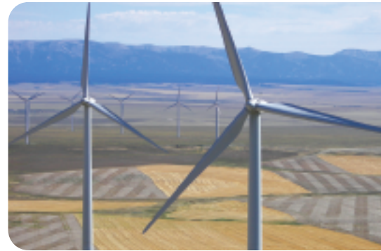
Rocky Mountain Power has made purchases on behalf of Blue Sky customers from the Judith Gap wind-energy facility in Montana.