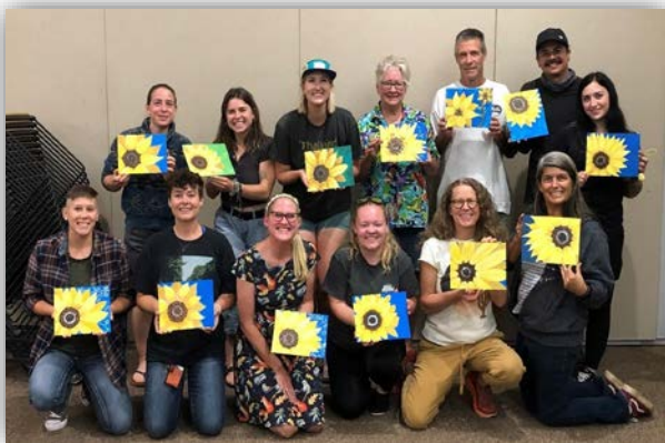
September Paint Night

Make a Spooky Halloween Orb at the Halloween Carnival – Saturday, October 29 th from 3:30-5:30p at the Rockville Community Center - Stop by our booth at the