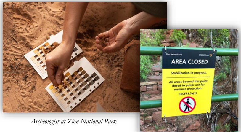
Archeologist at Zion National Park

If you have questions about the closure or how you can help protect archeological sites , please contact jonathan_shafer@nps.gov .