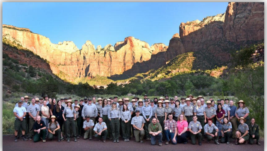
2016 Zion National Park Staff Photo

Learn more at: go.nps.gov/ZionRangerPrograms