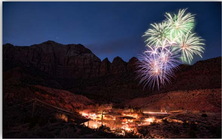
Fireworks light up the skies over Springdale!