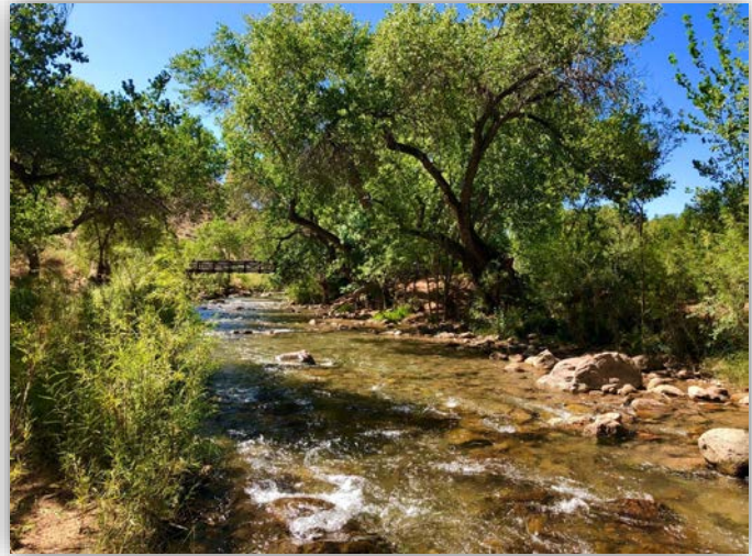
A portion of the Virgin River passing through the George A. Barker Park in Springdale.

Please come to an open house on Thursday, October 17 at 5:00pm in the Canyon Community Center to discuss the next steps on the Virgin River Management Plan (VRMP). The Town is working with engineers and river system experts to create land use standards for new development and redevelopment in the river corridor. The goal is to guide new development in a way that protects and promotes the health of the river corridor. Come see what is being proposed and offer your feedback and insight.